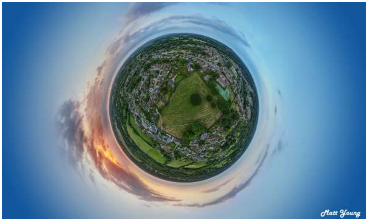
Dormansland