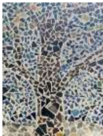
One of the cherry tree mosaics