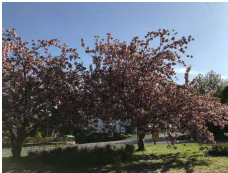
The iconic Dormansland cherry trees on the triangle