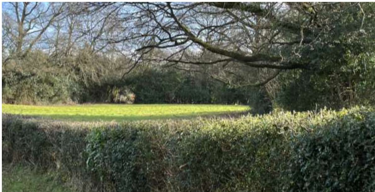
Beautiful Dormansland looking up from the Twitten from the station