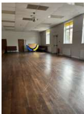
The hall floor, lovingly restored by Dormansland craftspeople.