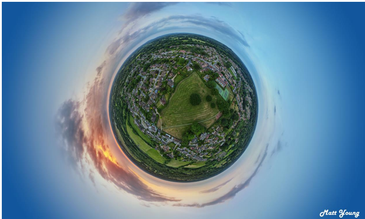
Dormansland