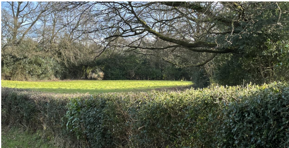
Beautiful Dormansland looking up from the Twitten from the station