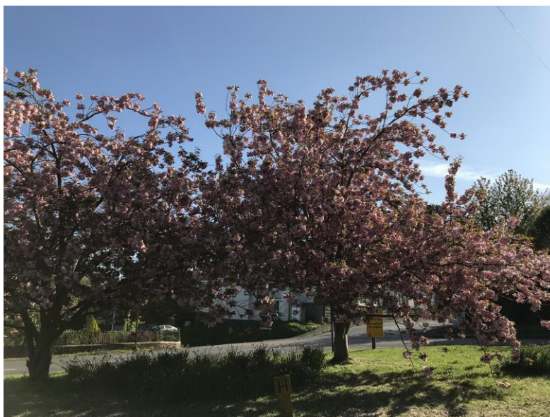
The iconic Dormansland cherry trees on the triangle