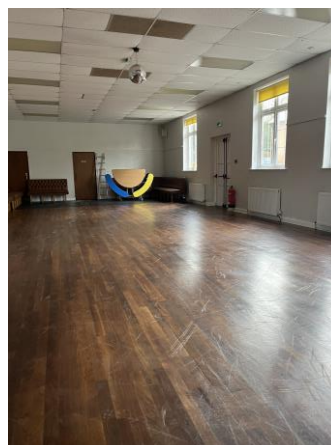
The hall floor, lovingly restored by Dormansland craftspeople.