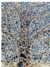
One of the cherry tree mosaics